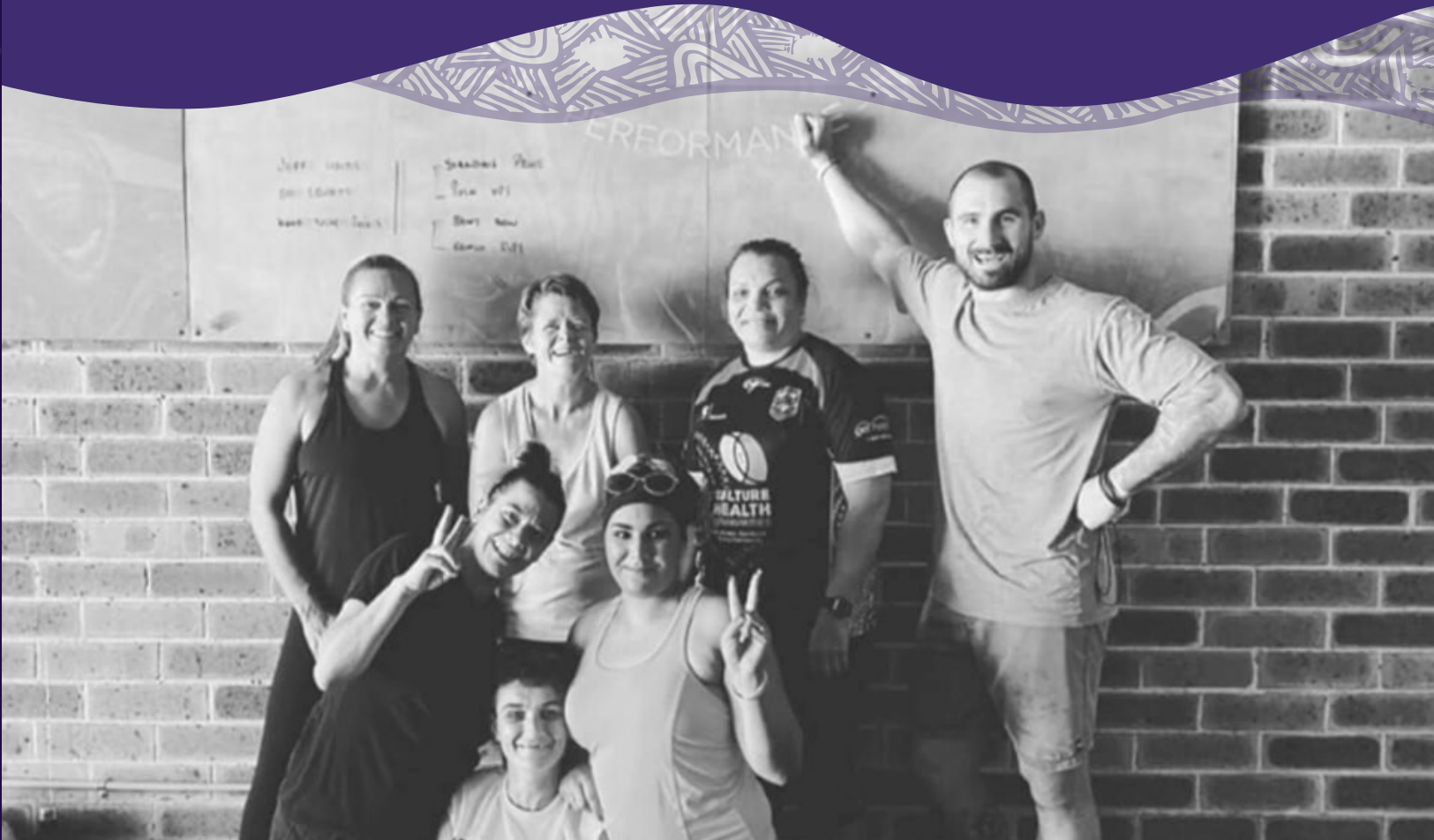
Members of our Yadhaba Group working out to increase their physical and mental wellness. Thank you to Coastal Performance Training for their support.

Our Yadhaba team maintains a focus on mental health and drug and alcohol support, the team includes a Mental Health Nurse and Aboriginal Health Workers.